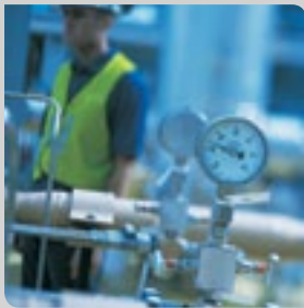
Field Force Automation