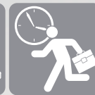
Work Order Tracking